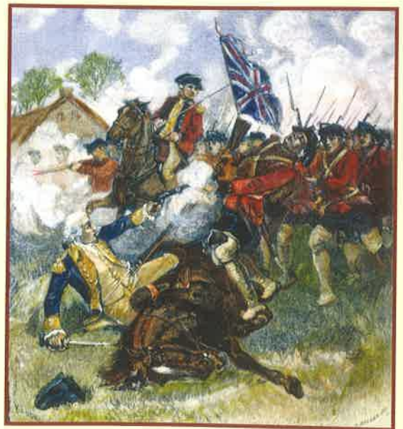
▲ Benedict Arnold

Had Benedict Arnold died on the battlefield at Saratoga, he would be remembered today as a hero. But later in the war, he became a spy for the British. He planned to hand the keys to the fort at West Point to the British. But the plot was uncovered. Arnold managed to escape to England. He died there in 1801. His place in history is as a traitor, not a hero.